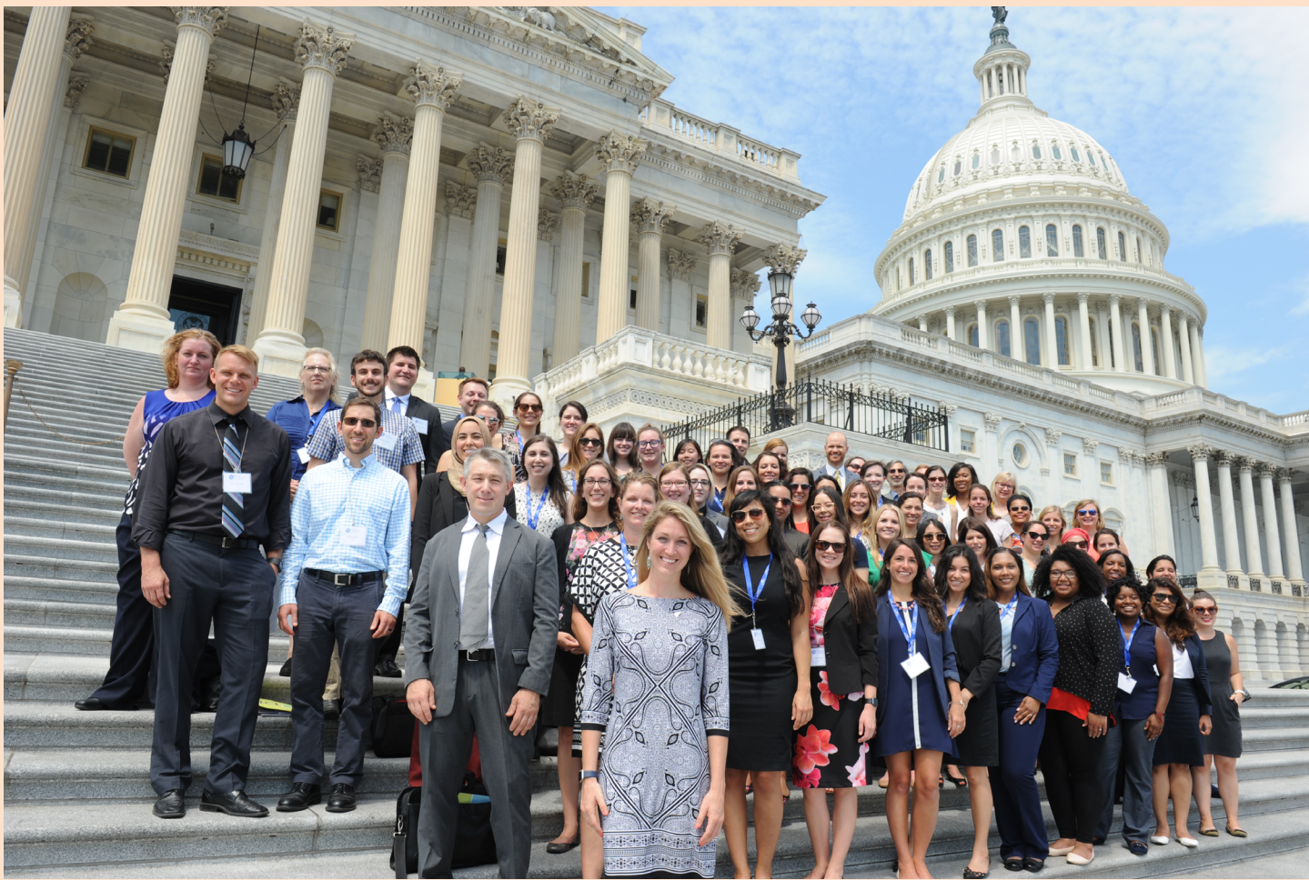
Policy Workshop and Advocacy Day Participants on Capitol Hill