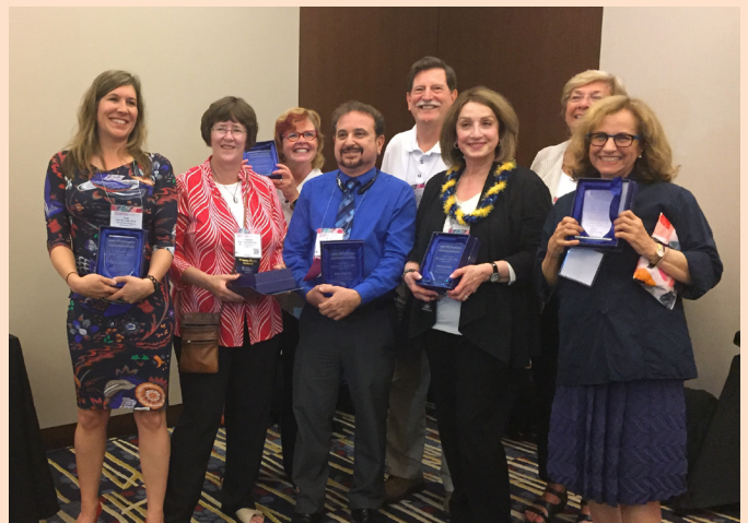
Division 56 presidents at reception celebrating the 10th anniversary of the Division becoming an official APA Division in 2007. Previous year was the 10th anniversary of the Division becoming a provisional Division in 2006.