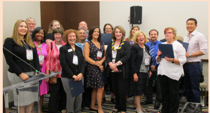
Executive Committee members at the Division 56 reception.