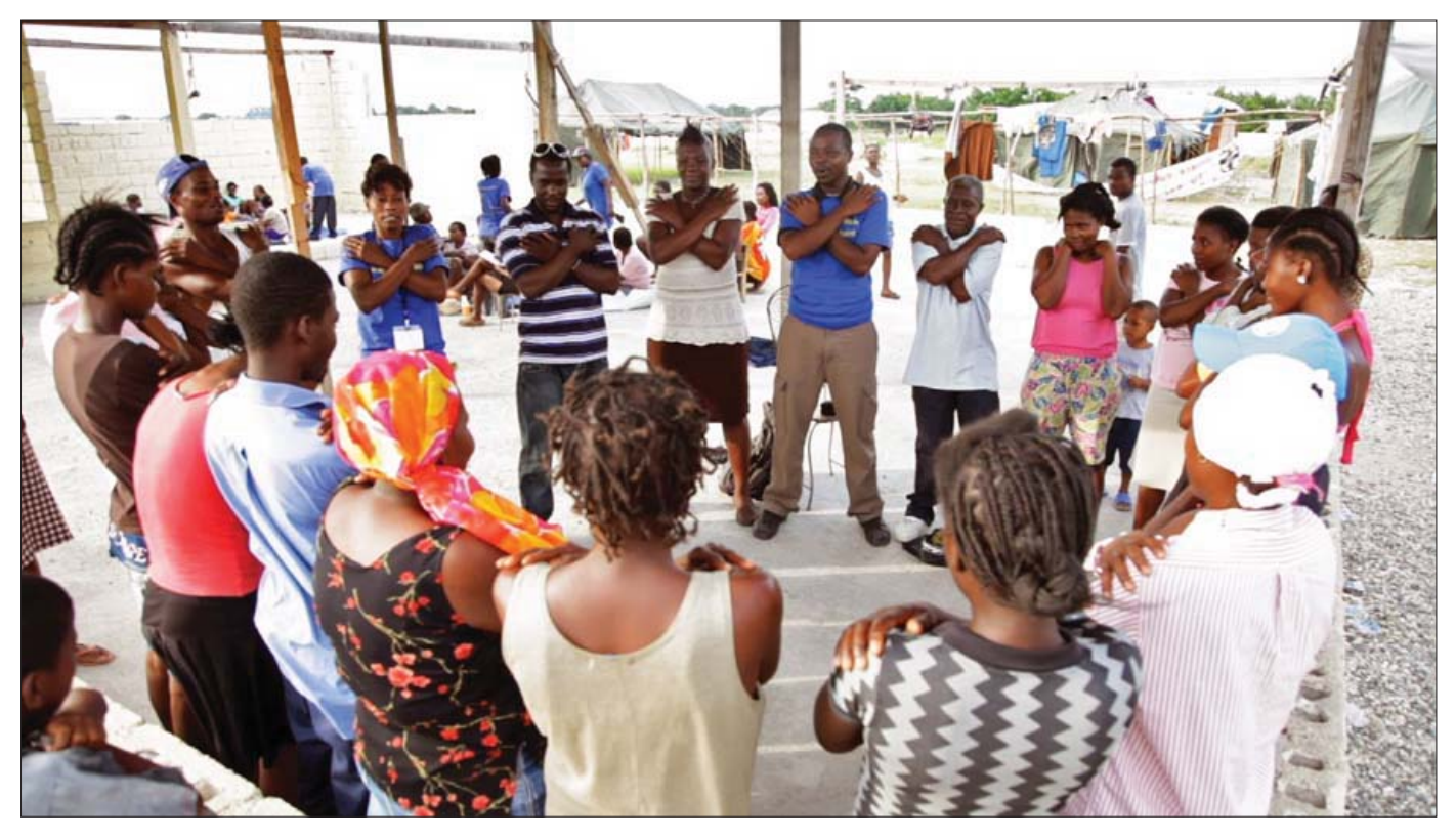
Ajan Sante Mantal (ay mental health workers) teaching the butterfly hug, a relaxation technique, to residents of a camp for displaced peoples' in Port-au-Prince, Haiti.